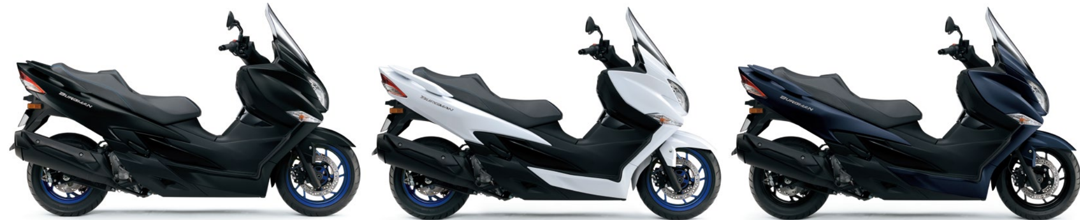
Metallic Mat Black No.2 (YKV)