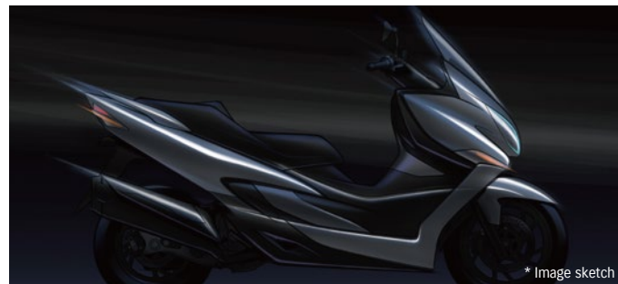
* Image sketch

It fits well, like a fine handmade suit. It rides comfortably and performs like a champion. It manoeuvres brilliantly. And it delivers a winning combination of stylish design, practicality and convenience. The BURGMAN 400 - bringing greater class and pleasure to your journey.