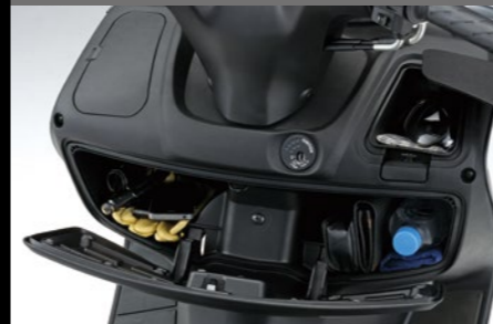
Front compartments and 12V DC outlet

Life with the BURGMAN is a four-letter word: EASY. Please, want for nothing. After all, you've got the space to carry a briefcase, a gym bag, or an extra helmet for a friend. Accept no compromises. The BURGMAN 200 is big enough to make its presence felt in rush-hour traffic and sleek enough to slip through an alley for a shortcut home.