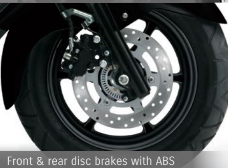
Front & rear disc brakes with ABS

A large windscreen helps keep you comfortable by shielding you from wind, insects, and road debris. Vent duct located at bottom of windscreen reduces wind turbulence and increase comfort.