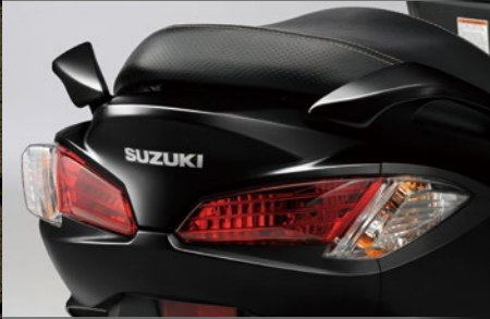
Dual tail lights and turn signals

Sharply styled dual headlights have a bold, elegant look and ensure an excellent view of the road ahead.