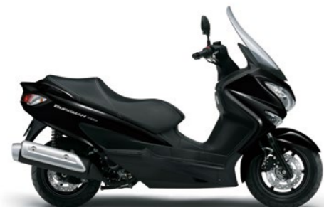
New Titan Black (YNR)