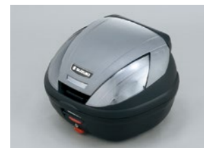
Top Case 37L*

*Coloured cover to be ordered separately.