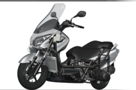
Chassis and suspension

240mm front disc with 2-piston caliper and 240mm rear disc with single piston caliper provide efficient braking performance. Front and rear disc brakes with an Antilock Brake System (ABS)*. The system monitors wheel speed, and matches stopping power to available traction.