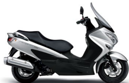
Metallic Mat Platinum Silver (ZRP)