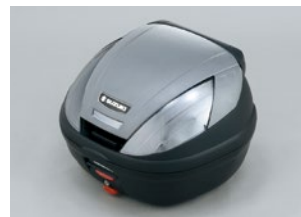
Top Case 37L*

*Coloured cover to be ordered separately.