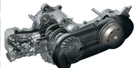
*BURGMAN 200's engine shown